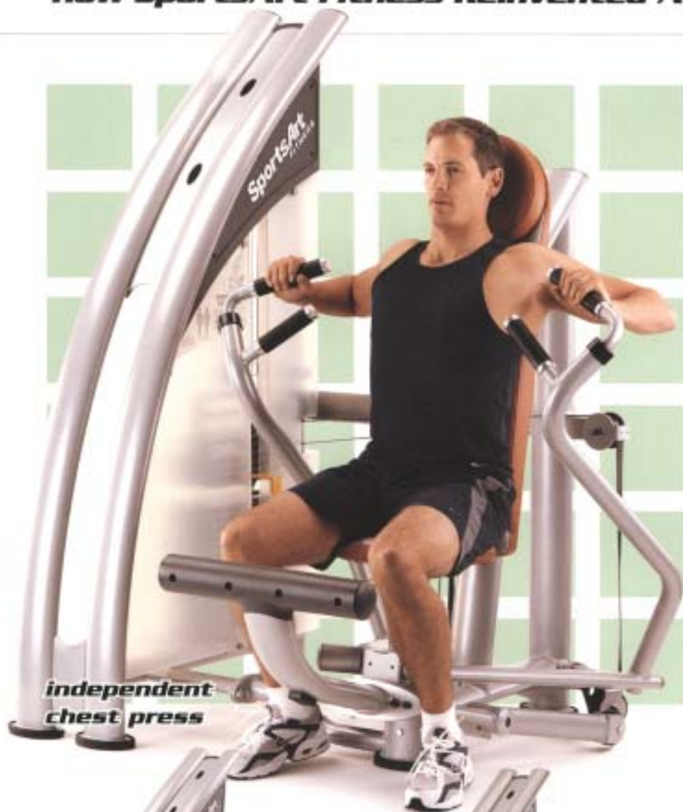
independent chest press

How SportsArt Fitness Reinvented An Entire Category