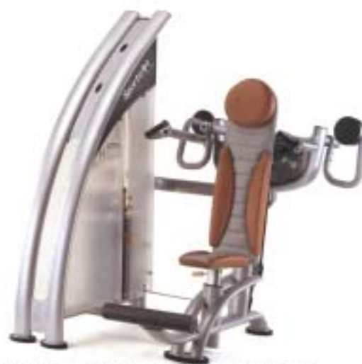
independent shoulder press