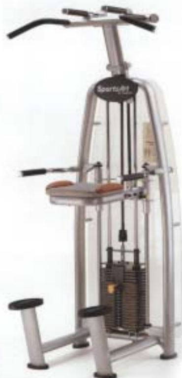
assisted chin dip

For more information please call 1-800-709-1400 or visit their website at www.sportsartfitness.com .