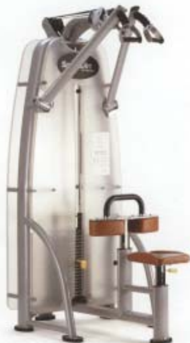
independent lat pull